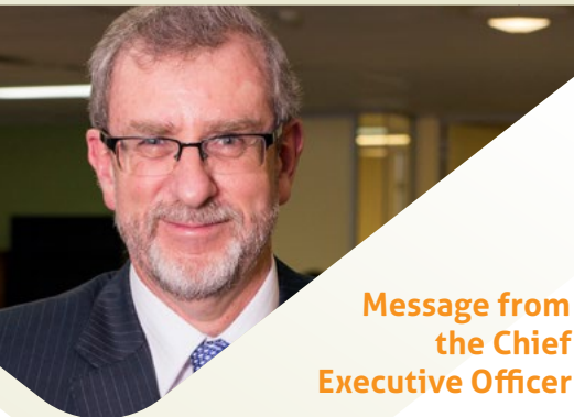
Message from the Chief Executive Officer

Welcome to the winter edition of WNews. In this edition you will find updates on Wentworth's fundraising activities, a snap shot of our tenant survey results, engagement activities with the local community and upcoming events.